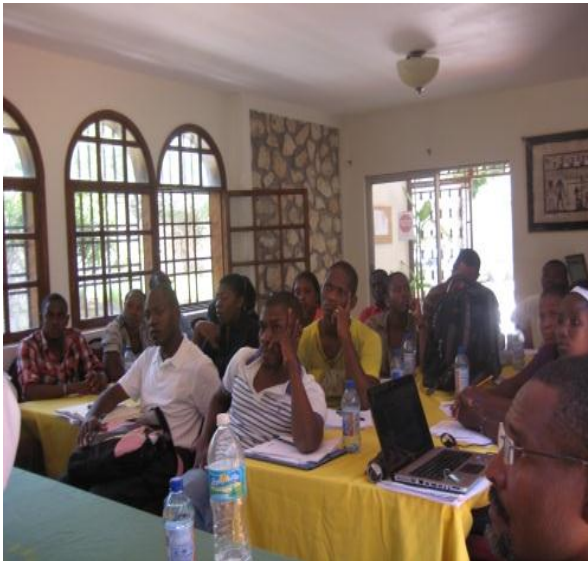
Image: Research seminar on Diaspora Contributions to Haitian higher education