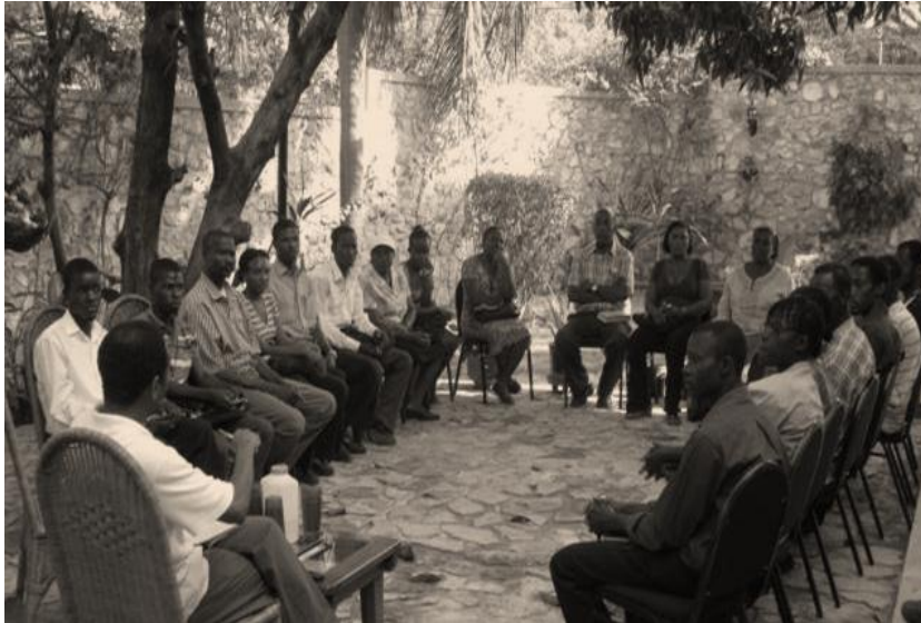
Image: Meeting with parents of Brazil scholarship recipients of Cite Soleil.