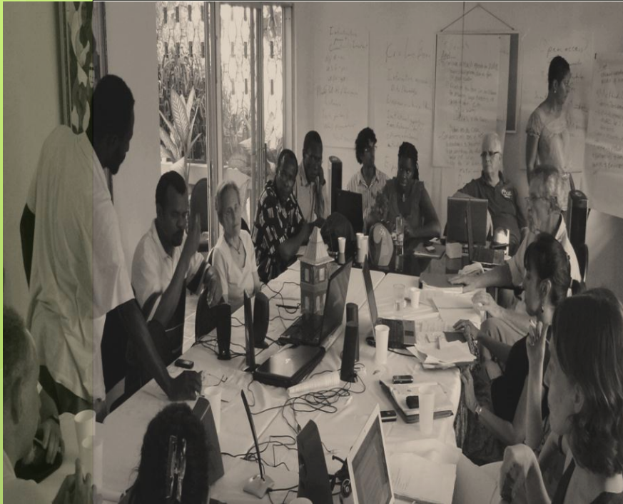
Image: INURED's transnational network of researchers, policymakers and practitioners at the 2010 Annual Meeting.