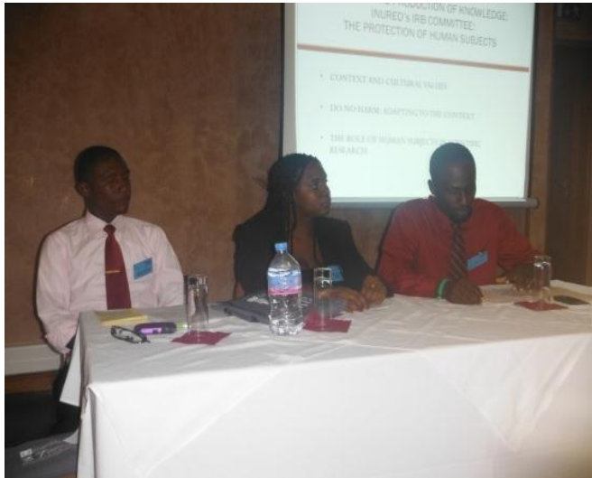
Image: INURED Research Assistants presenting the Violence Against Children study at the 2012 Caribbean Studies Association Meeting in Gosier, Guadeloupe.