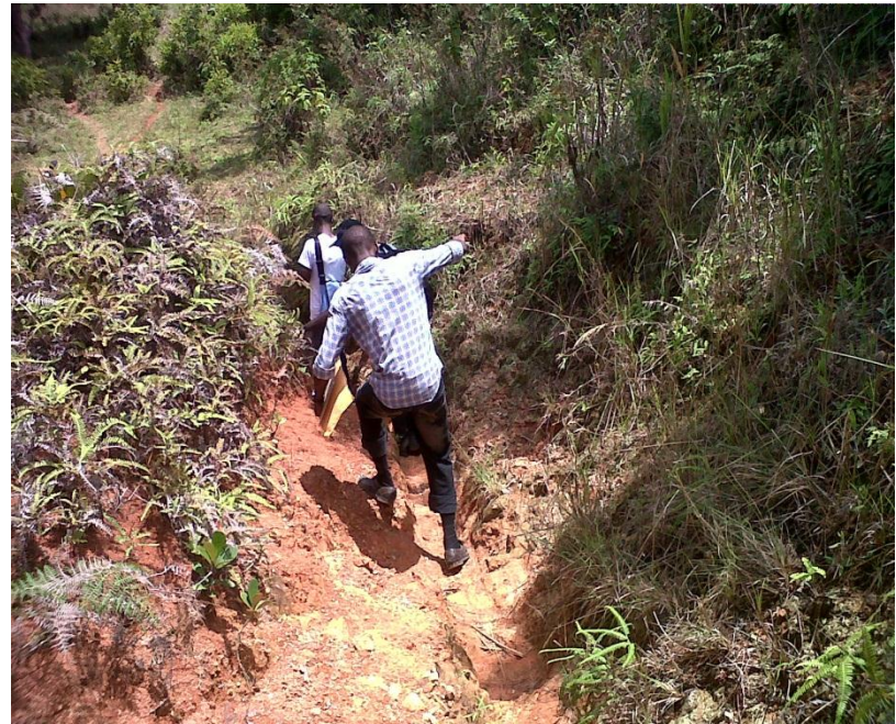
Image: INURED researchers traveling to a survey site in Fond Bleu