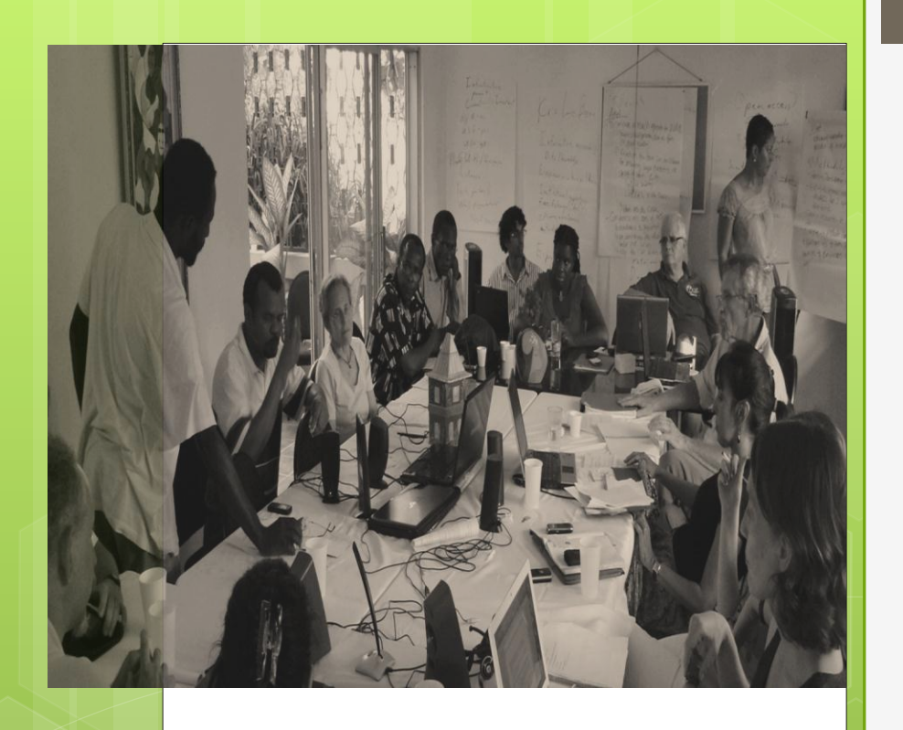
Image: INUREDs transnational network of researchers, policymakers and practitioners at the 2010 Annual Meeting.