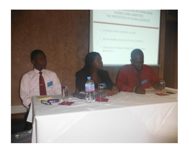
Image: INURED Research Assistants presenting the Violence Against Children study at the 2012 Caribbean Studies Association Meeting in Gosier, Guadeloupe.